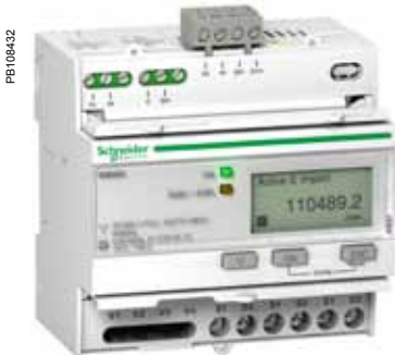
Energy Meter Series iEM3255