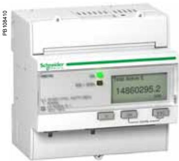
Energy Meter Series iEM3100