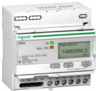
CTs connected (1 A / 5 A)