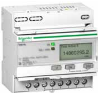
Direct connected up to 63 A